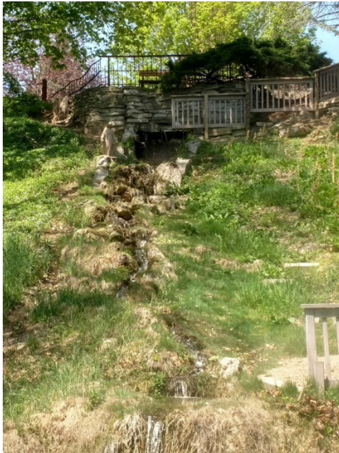
The Springs today