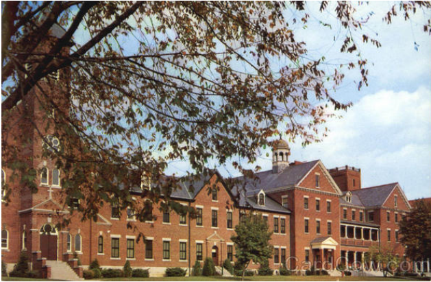
Historical photo of the Kneipp Springs Sanitarium - convent of the Sisters of the Precious Blood