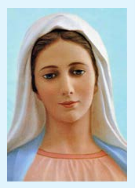
Thank you for having responded to my call."

May everything you do be for the glory of God, and then Heaven will fill your heart with joy and you will feel that God loves you and is sending me to save you and the earth on which you live.